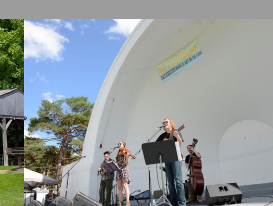
BAND SHELL CONCERT