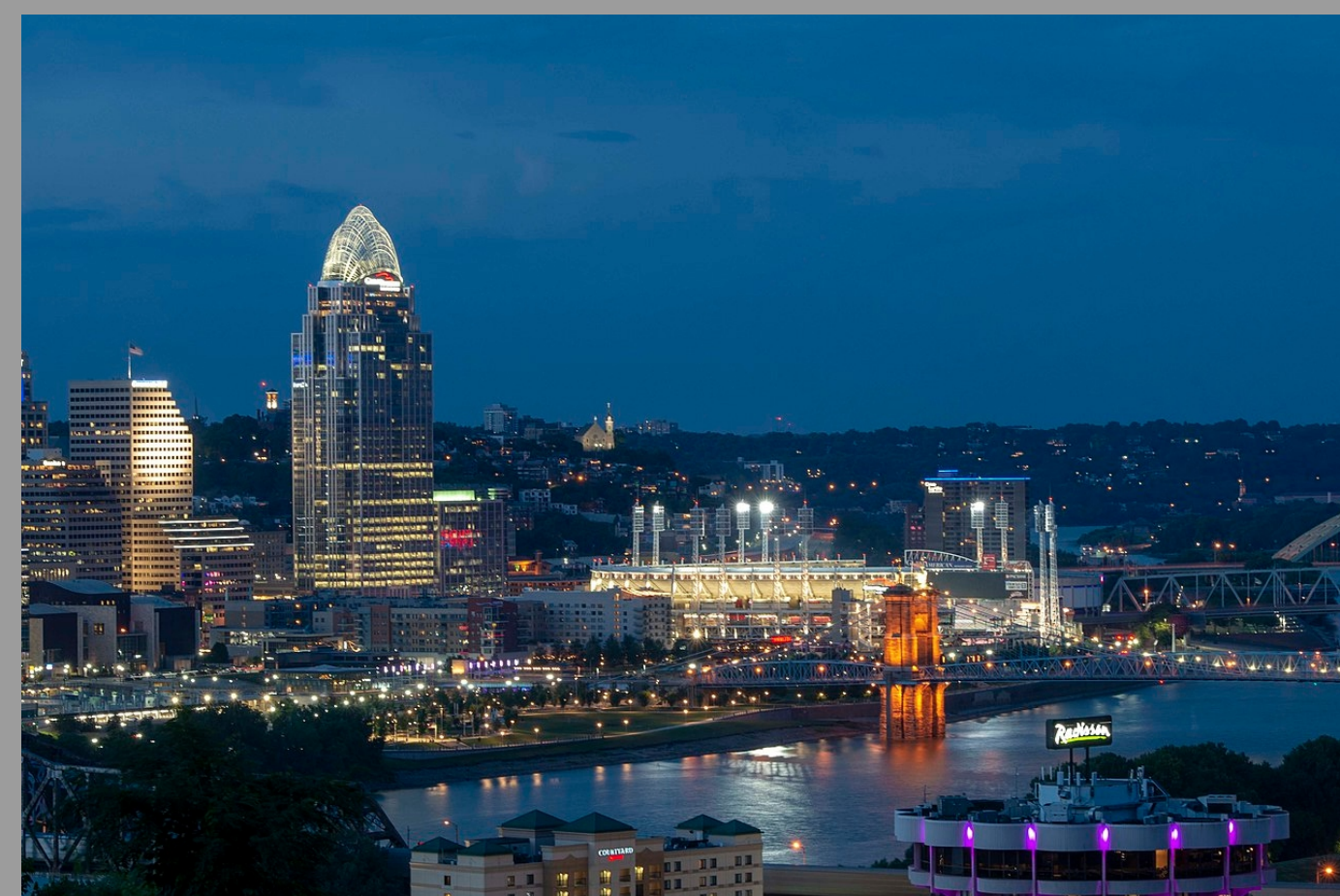
POINTTOWN CINCINNATI, OH VIEW FROM DEVOU PARK OVERLOOK