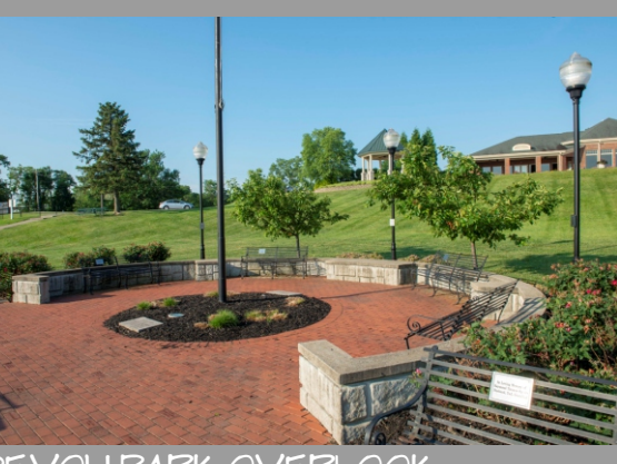
DEVOU PARK OVERLOOK