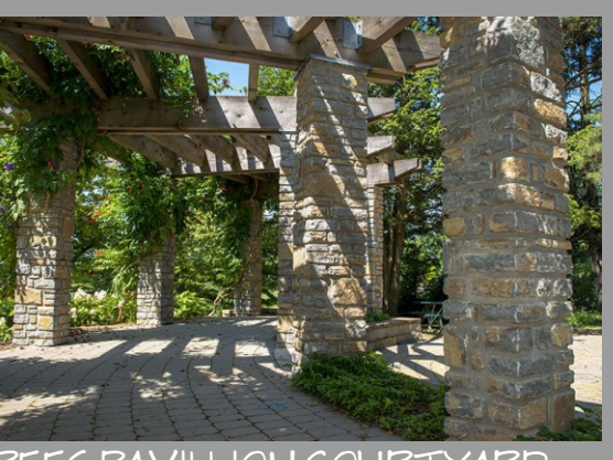
DREES PAVILION COURTYARD