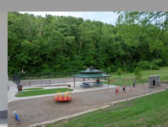
DEVOU PARK PLAYGROUND