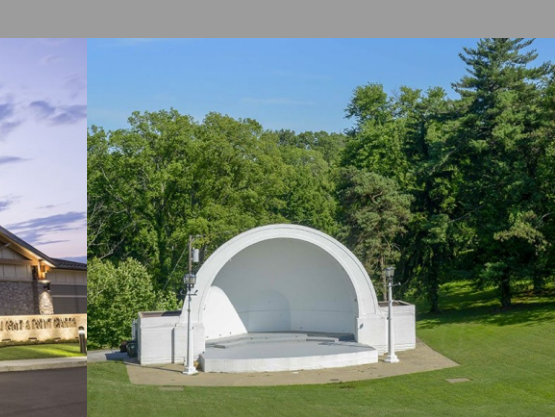
DEVOU BAND SHELL